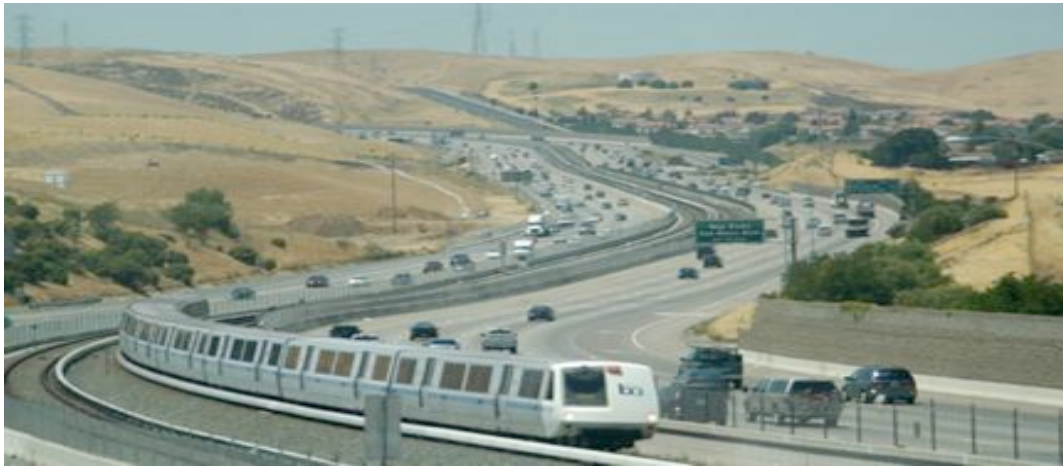
A BART train approaches the Pittsburg/Bay Point station in the Highway 4 median.

Besides two more 20-week cohorts, Los Medanos College is also starting its two-year program this January for those unskilled students and workers who are new to industry. The students who complete either the two-year program or the intensive 20-week course will qualify for process tech positions which start around $50,000. After a few years, the pay with overtime could jump to $100,000 say industry insiders.